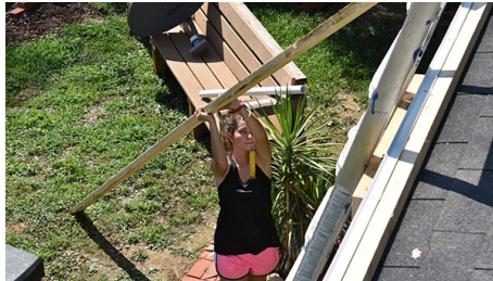
Salkehatchie Summer Service - South Carolina UMC (umcsc.org)