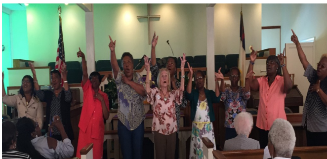
"How Great Thou Art"