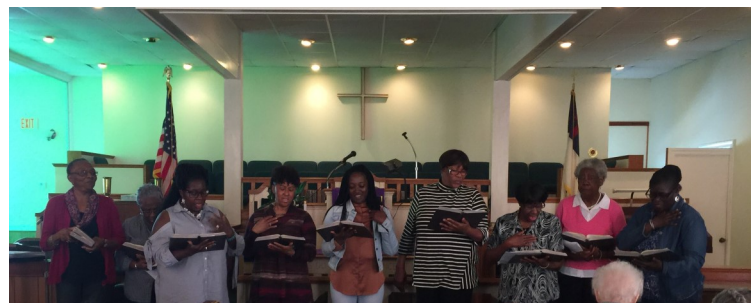
"He Touched Me"