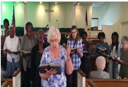
"Onward Christian Soldiers"

Beaufort/Walterboro Cluster Meeting held on February 24, 2018 at Wesley Grove United Methodist Church in Cottageville