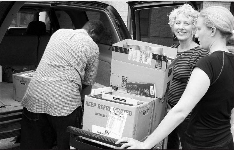
Today (Tuesday) is the final MBE processing event, held here in the Florence Civic Center. Help is still needed; register at www.millionbookeffort.org . At left, volunteers load books during the Greenville District's Processing Event, held May 31.