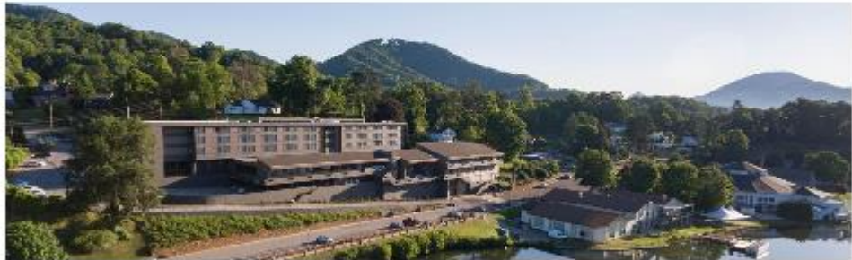
The Terrace Hotel

Package Rates are inclusive of taxes and 8% gratuities for meal serving staff.