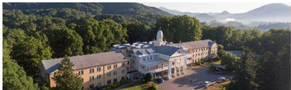
The Lambuth Inn