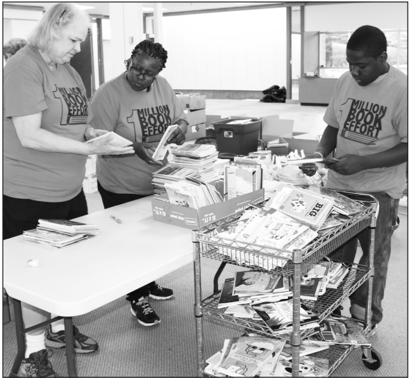
Volunteers sort books at the Rock Hill District's Book Processing May 31. The final processing is Tuesday at the civic center; sign up to help.

Volunteers are needed for Tuesday to receive, sort, package and place bookplates in each book to prepare them for distribution to organizations that work with children in poverty, from schools to tutoring and enrichment centers. To sign up, go to www.millionbookeffort.org and scroll down the list