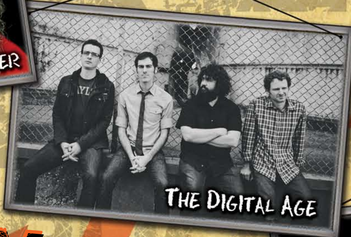
THE DIGITAL AGE