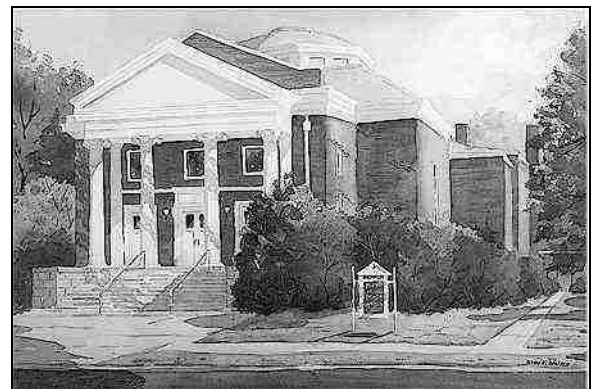
Broad Street UMC in Clinton, SC