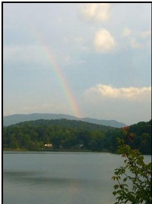
A rainbow rises from the hills at Lake Junaluska, North Carolina.