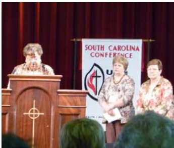
Spiritual Growth Retreat, 2011