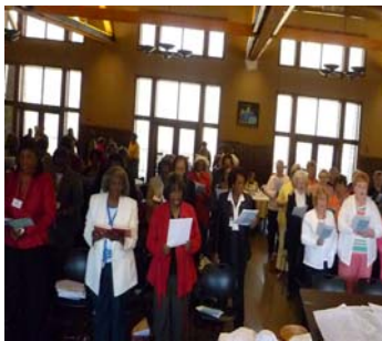
Day Apart, 2011