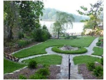
Spiritual Growth Retreat, 2011