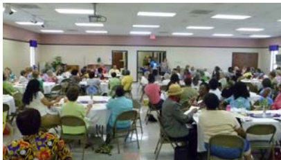
Come Together, Be Together, 2011