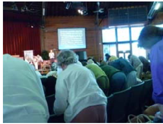
Spiritual Growth Retreat, 2011 Lake Junaluska,