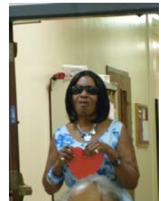
Come Together, Be Together, 2011