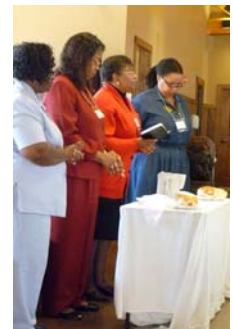
Day Apart, 2011