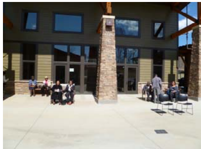
Day Apart, 2011