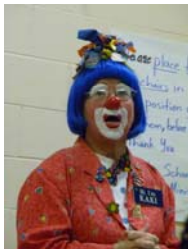
Come Together, Be Together, 2011