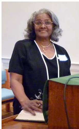
South Carolina Nission Projects Emphasis Months.

Happy Holidays from Your Greenville District Officers