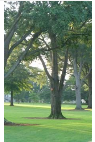
Spartanburg Methodist Campus