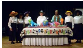
Skit of Historical UMW meeting