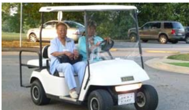
Transportation at School of Mission