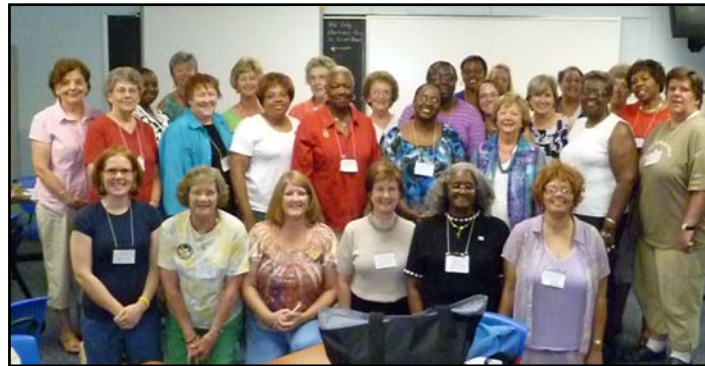
Greenville District Attendees 2010