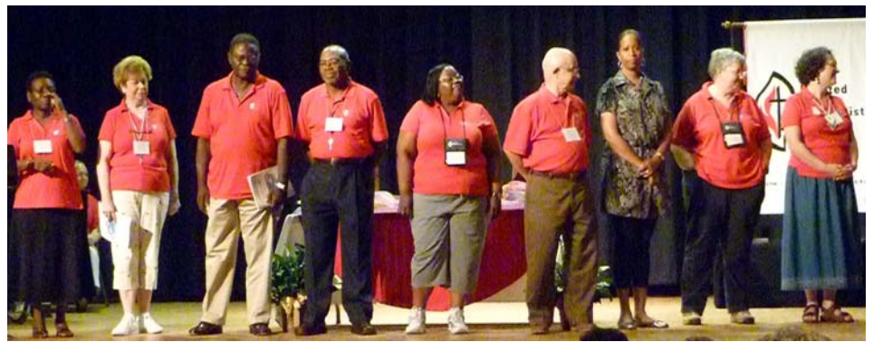
School Of Christian Mission Instructors 2010