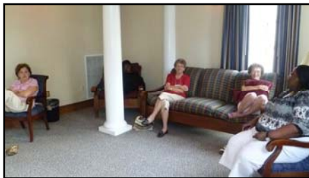
Reflecting after a hot day 2010