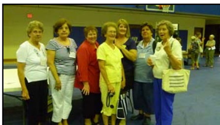
Greenville District Members 2010